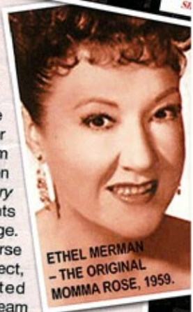
ETHEL MERMAN – THE ORIGINAL MOMMA ROSE, 1959.